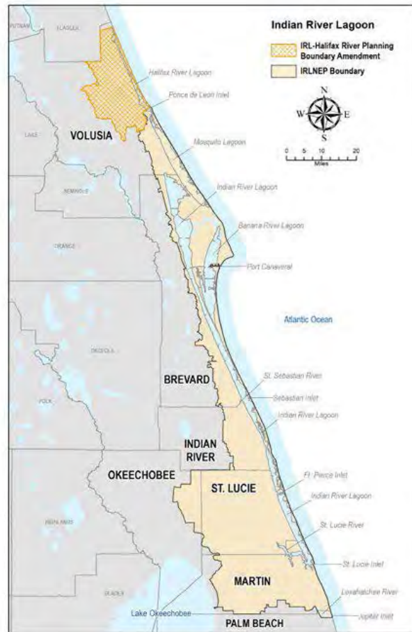
Map of IRLNEP watershed. Only projects located in the watershed and northern planning boundary (orange outline) will be considered for funding.

A. Grant requests may not exceed $5,000. The IRLNEP may choose to fund a project at less than 100 percent of the requested budget.